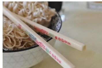
made of _____