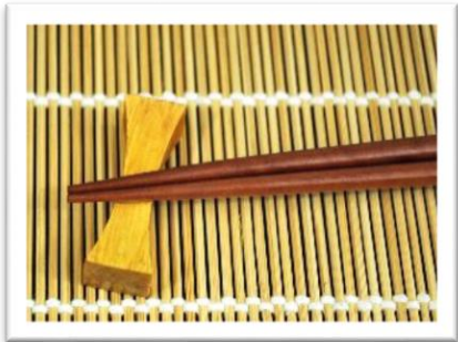
Japanese Chopsticks →