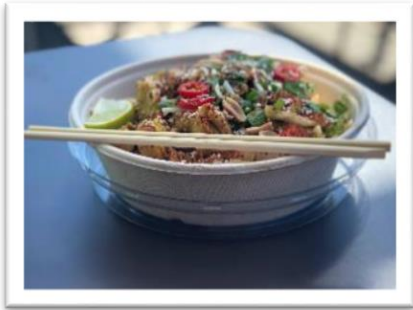
Chinese Chopsticks →