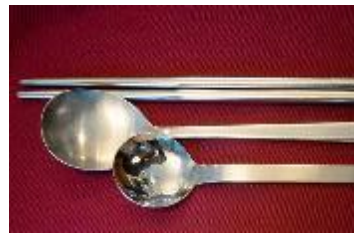
made of metal