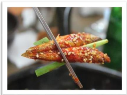
Korean Chopsticks →