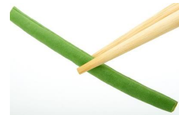
made of wood